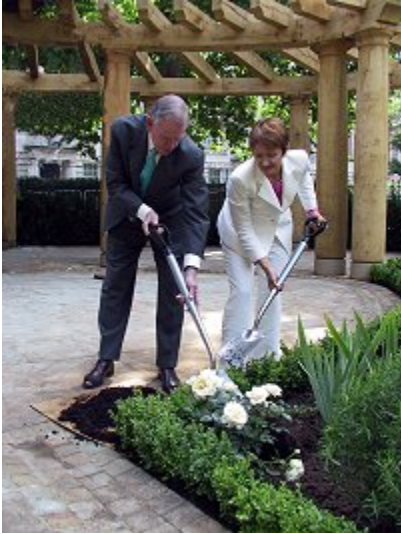
Ambassador William Farish and Tessa Jowell planting white roses in the memorial garden in Grosvenor Square on July 7, 2003.

A permanent memorial garden to those who lost their lives in the United States on September 11, 2001 has been built by the British government in Grosvenor Square Garden, London, which is bordered on its west side by the U.S. Embassy. The